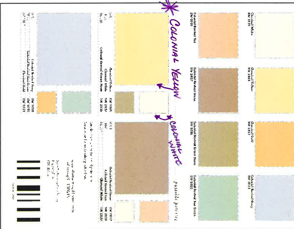
Figure 7.4: This Sherwin Williams "Classical/Colonial" Color Palette is appropriate to the Marietta Historic District.

12. WHITE TRI & AMBER: WHITE BECAUSE. For the sake of safety, experiment with more than 1 color from the palette and choose the color that is most appropriate for the room. For example, a bright red wall in a bedroom might be a good choice, but a bright red wall in a living room might not be the best choice. Use the color palette as a guide to help you choose the right color for the room.