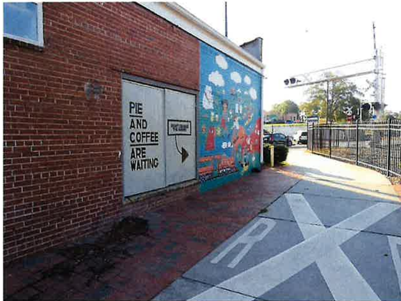
Exterior of Building as of September 2022

The painting on the right door is 37.5" tall x 35.5" wide.