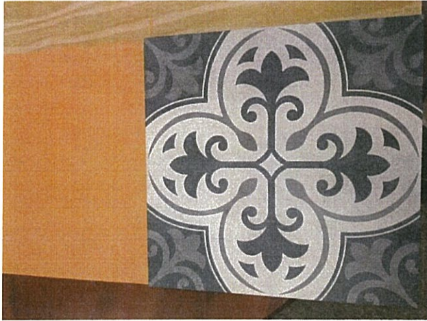
Tile and Wall Paint Sample