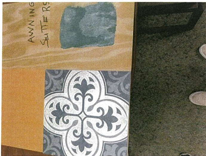
Awning, Shutter & Wall Paint Color (with Tile)