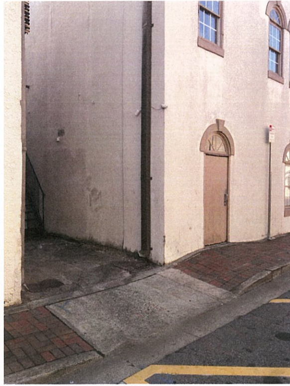
Rear of 109 Anderson Street on Winters St at Private alley.