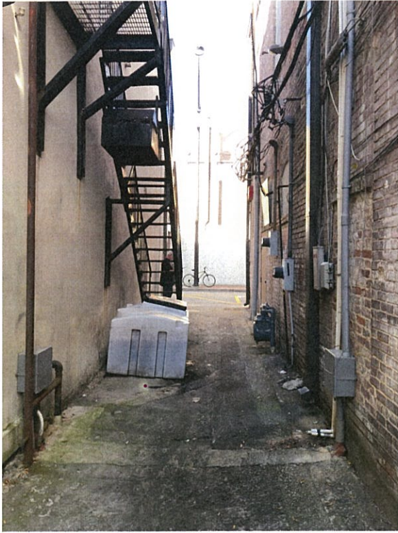
Private alley looking west towards Winters St.