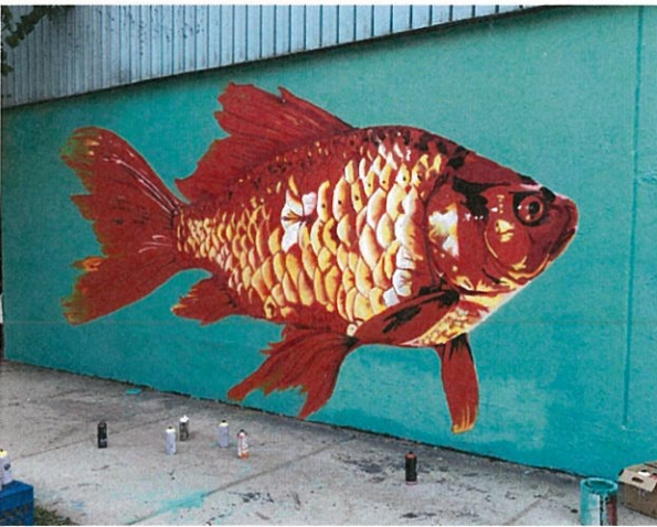
Hansel Street wall of House of Lu (not to cover entirety of wall)